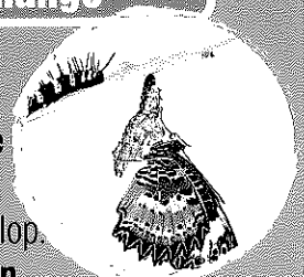
Bryony Walls (service user)

We believe in second chances and that everyone has the capacity to learn and develop. We are all human